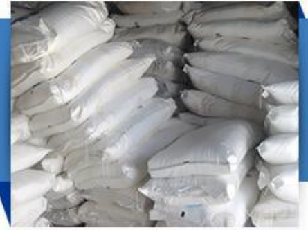
Production Raw Materials Warehouse